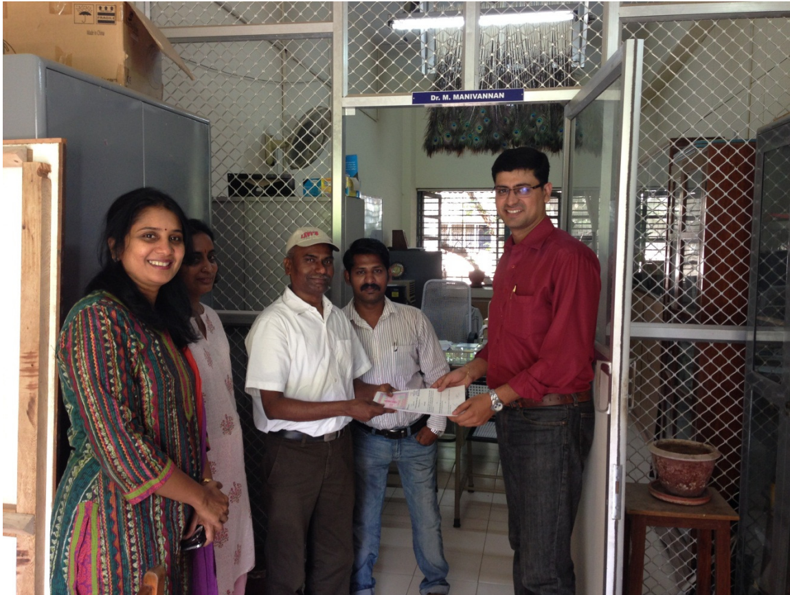
ALERT AT JFX EVENTS – BREAK IT DOWN