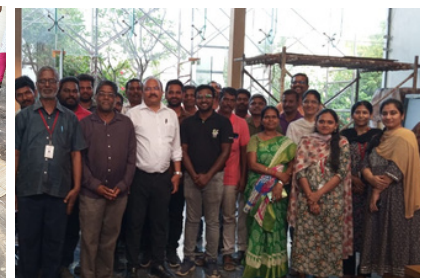
PEER program at Mayflower Enterprises Pvt Ltd