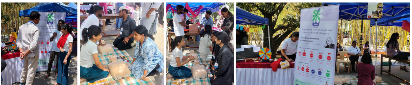
First aid awareness, CPR Experience Zone at Christ University during the SDG week