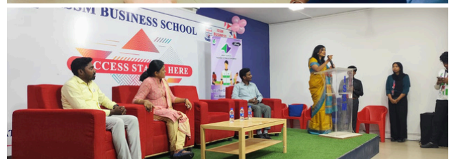
ISSM Business School