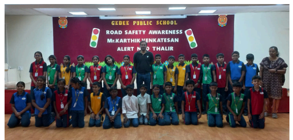
Road safety awareness and first aid program at Gedee Public School