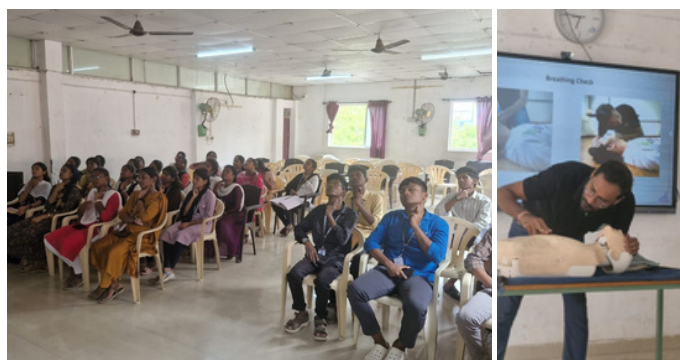
PEER program at Nehru College of Physiotherapy