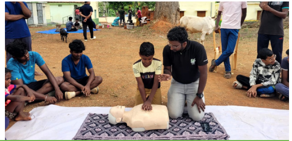
PEER Basic program for students and staff of Govt. School, Maanar Tribal Village