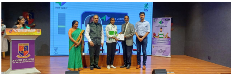
Avichi College of Arts and Science