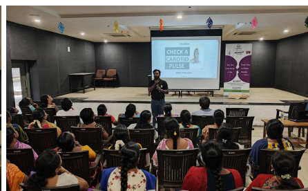
PEER program at Karpagam Academy of Higher Education