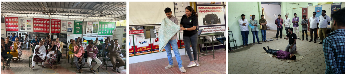
PEER Basic program at RTO Central, RTO North

A glimpse of some of our training programs