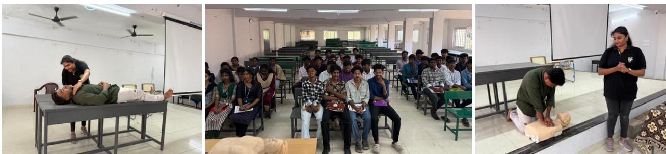
PEER program at Cheran College