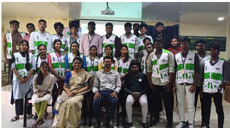
Prince College of Engineering