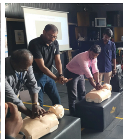
PEER program for gym trainers at SKS Hospital