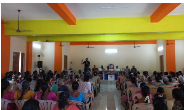
PEER program at Chinmaya Organization