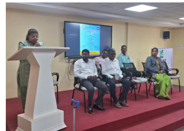
PEER Program for Acharya College of Arts and Science