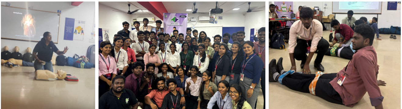
VoICE program for students of ISSM Business School, Chennai Powered by Ford