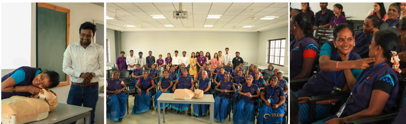
PEER program for students and sanitation workers at Kumaraguru College of Technology