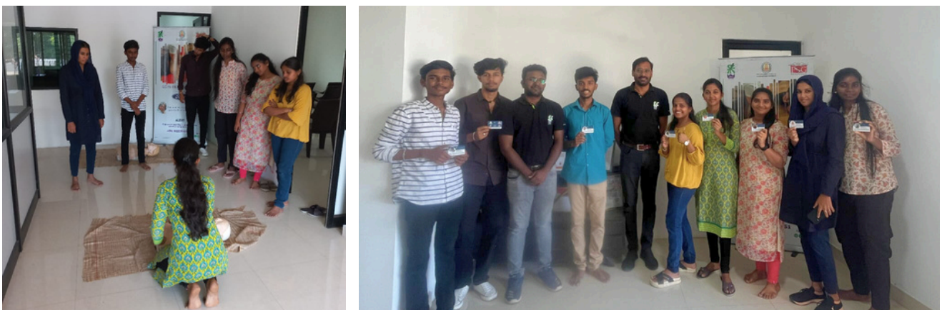
VoICE refresher program for our existing community of first responders, Coimbatore