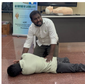
PEER program for women at Muthal Thalamurai Trust