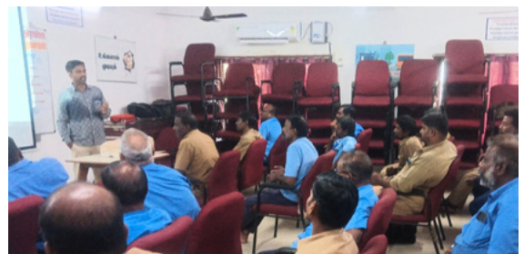
PEER program for bus drivers at MTC Chrompet