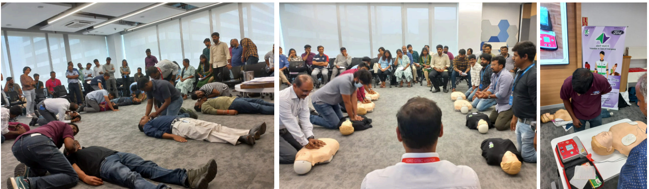
VoICE program for Ford employees

Our growing community of alert VoICE (Volunteers in case of emergency) is set to bring about a revolution in the way emergency care gets delivered in our society.