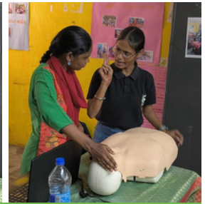
PEER program at Arunodhaya community