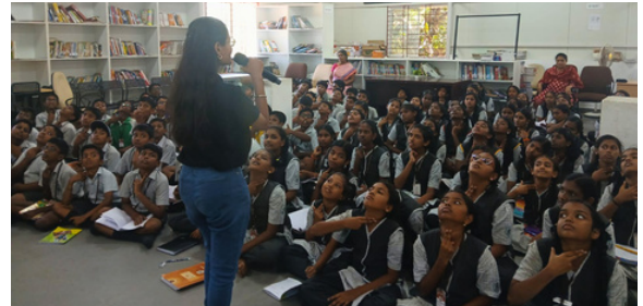
PEER Basic program for students of DAV-Sarada Eashwar Vidyalaya