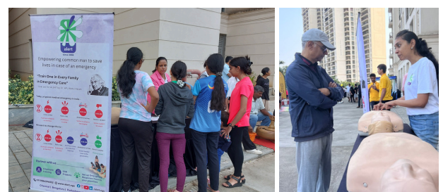
Happy Streets by Times of India at House of Hiranandani