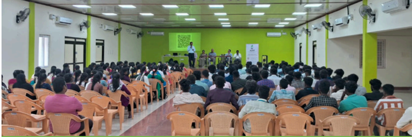
PEER Program for students of Indiragandhi College of Arts and Science

A glimpse of some of our training programs