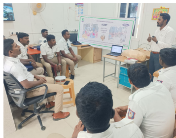
CPR and AED session for Shollinganallur Traffic Police