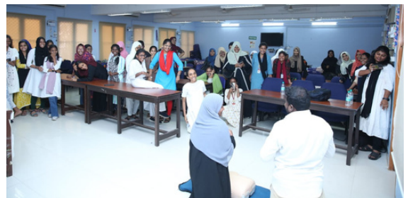
PEER program at S.I.E.T College for Women