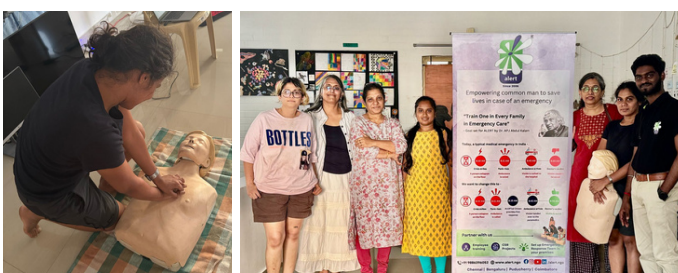
PEER program at Bidiru Learning Centre