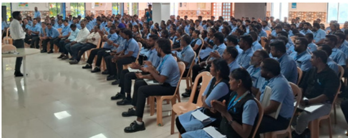
PEER Program for the staff at EATON