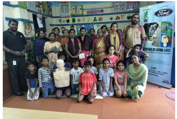
PEER program at Kakkann colony