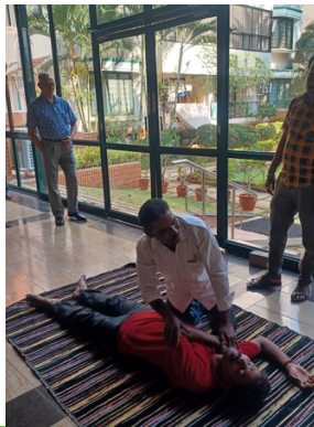
PEER program at Atrium Owners Association