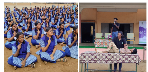
ALERT at School (Bharathi Kids School & Govt School, Coimbatore)