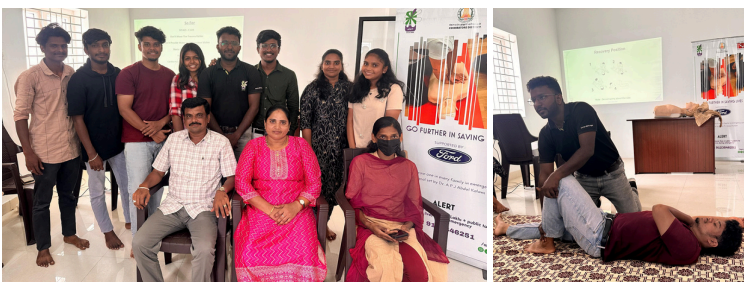
PEER program for general public at the ALERT office