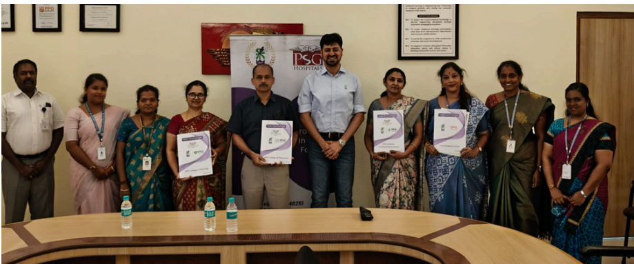
PPG Group of Institutions PPG College of Pharmacy, PPG College of Nursing, PPG Institute of Allied Sciences, PPG Business School