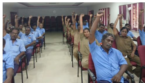
PEER Training for MTC drivers (Adyar and Chrompet Depos)