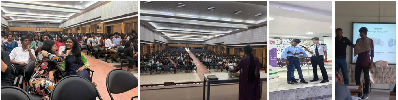
PEER Training at Colleges, empowering the next generation of life-savers