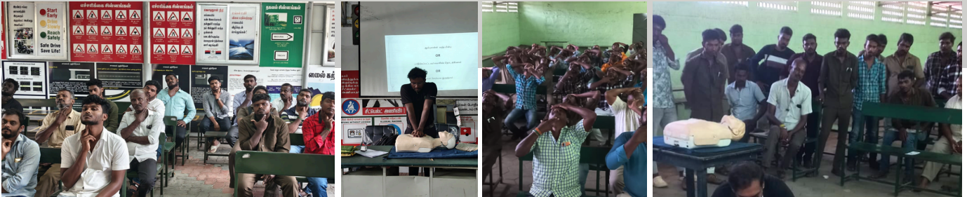
PEER Training at RTOs (Central, North, Sulur)

A glimpse of some of our training programs