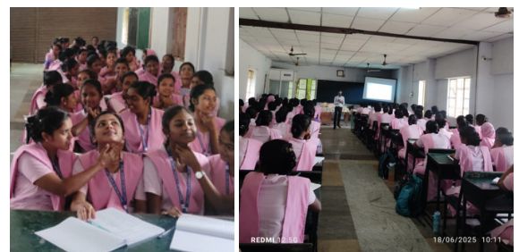
PEER Training at Texcity College of Nursing