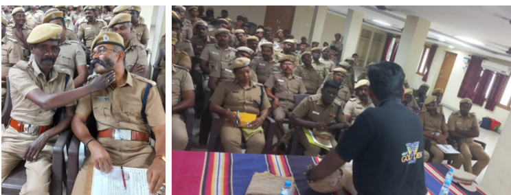
PEER Training for the Home Guard Armed Forces