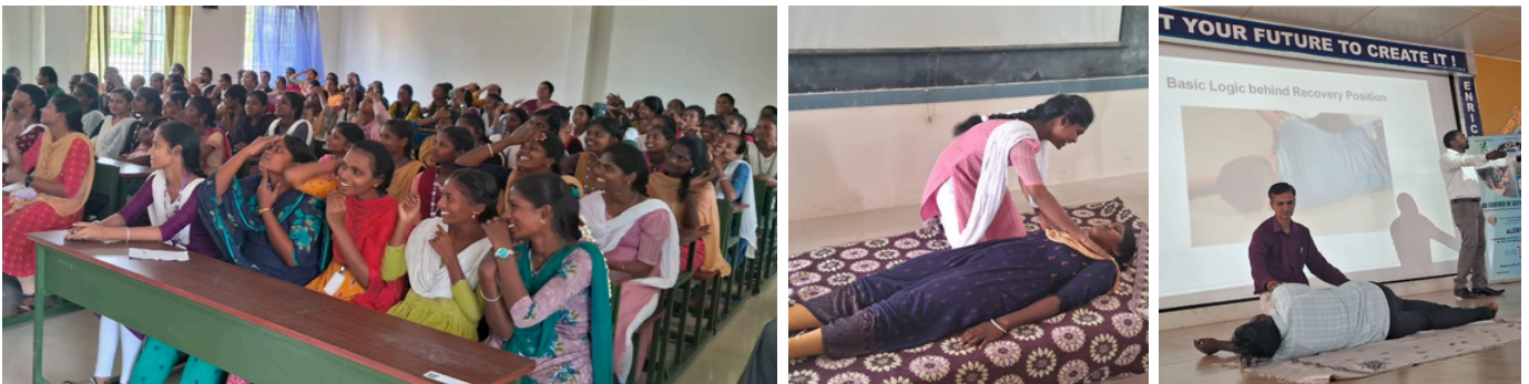
PEER Training at Colleges, empowering the next generation of life-savers