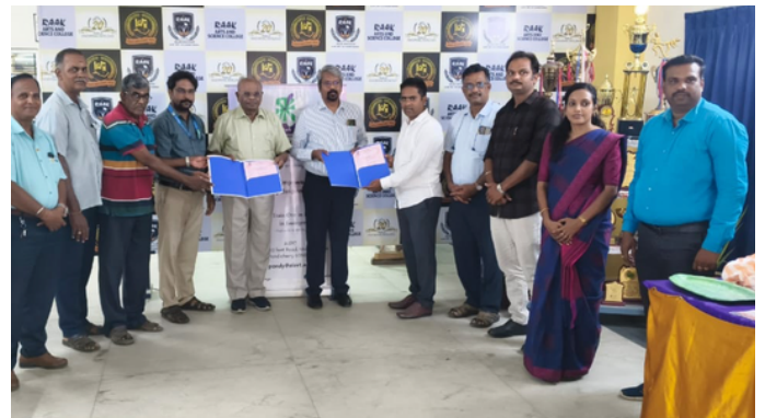
RAAK College of Arts & Science, Puducherry