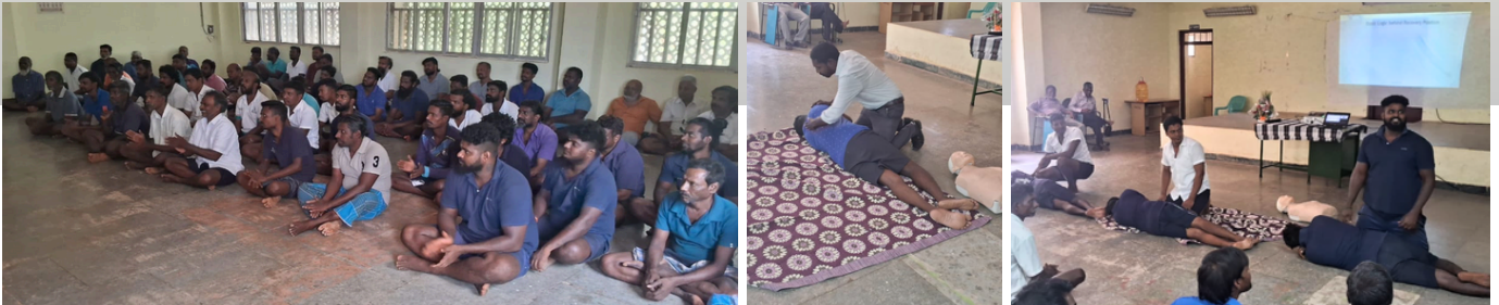
PEER Training for Prison inmates

A glimpse of some of our training programs