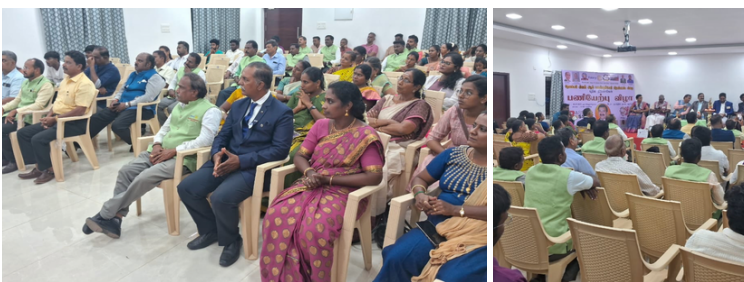
PEER program for Rotary Club of Pondicherry