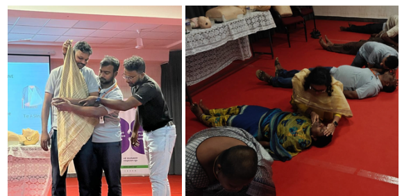
PEER Training at Adwaith Industries Pvt Ltd