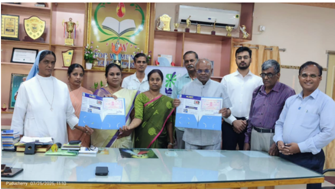
Immaculate College for Women, Puducherry

6 new colleges are onboard to establish ALERT Golden Army clubs in their institutions.