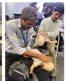
PEER Training for corporate employees