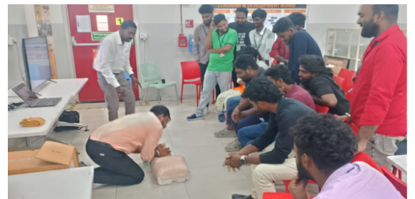
PEER Training for gig workers and drivers