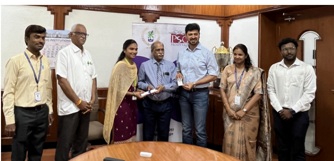
PSG College of Arts & Science (MoU was renewed)