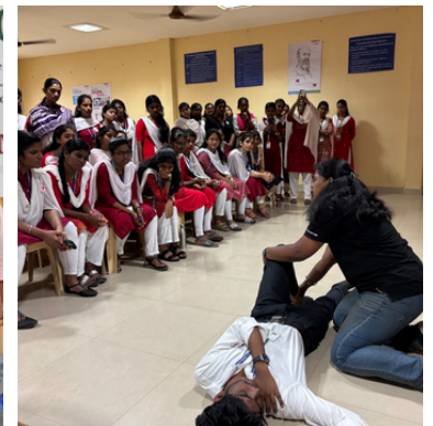
PEER Training at Colleges, empowering the next generation of life-savers