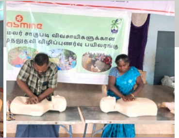
PEER Training at for farmers at Jasmine Organization