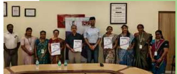
PPG Group of Institutions, Coimbatore

By training 1000 students, we empower 1000 families and their communities. We are realising the goal set by our mentor Dr. APJ Abdul Kalam to train one in every family in emergency response and create local volunteers.