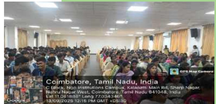
Dr. N.G.P Arts & Science College