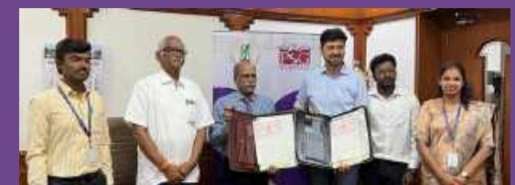
PSG CAS, Coimbatore