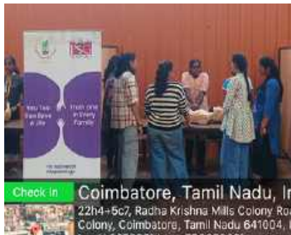
GRG Krishnammal College CPR Experience Zone and Emergency Response Training