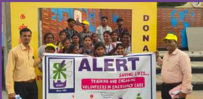
VLB Krishnammal College, Coimbatore