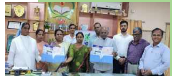
PPG Group of Institutions, Coimbatore