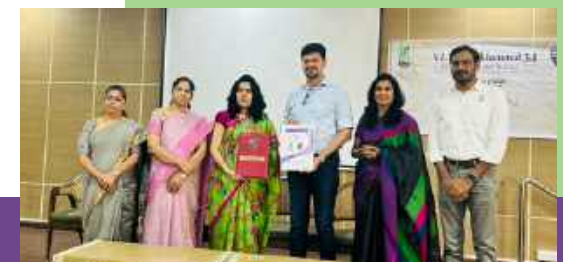
VLB Krishnammal College, Coimbatore