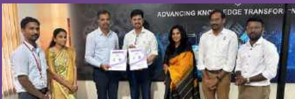
PSG Institute of Technology, Coimbatore