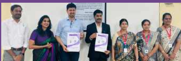
Dr. N.G.P College, Coimbatore