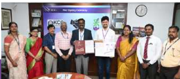
KCG College of Technology, Chennai