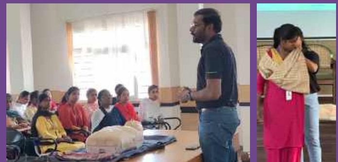
VLB Krishnammal College, Coimbatore