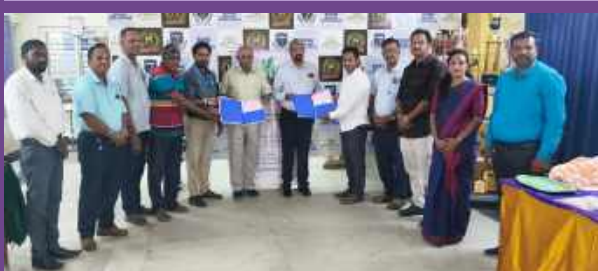
RAAK College, Puducherry