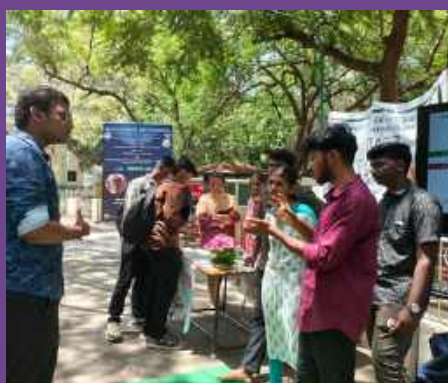
PSG College of Arts & Science, Coimbatore CPR Experience Zone and Emergency Response Training