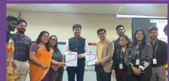
ICFAI IBS, Bangalore