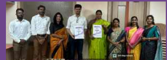
PSGR Krishnammal College, Coimbatore